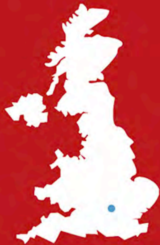
● You can find us here

International Slate Supplies Ltd Wayside, Fleet Marston Aylesbury, HP18 0PZ Tel: 0800 009 6062 Email: sales@internationalslate.co.uk